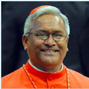
Cardinal Soane Patita Paini Mafi of Tonga. He was appointed Bishop of Tonga in 2007. On 14 February 2015, Pope Francis appointed Mafi a cardinal with the title of Cardinal-Priest of Santa Paola Romana.